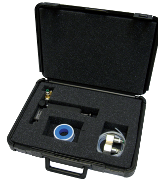
Model CPP7 hand test pump in transport case incl. standard accessories