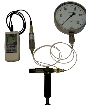
Application, calibration with model CPP7 hand test pump and model CPH6200 reference measuring instrument