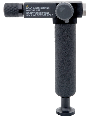
Model CPP7 hand test pump

If one connects the test item and a sufficiently-accurate reference measuring instrument to the hand test pump, on actuating the pump, the same pressure will act on both measuring instruments. By comparison of the two measured values at any given pressure value, a check of the accuracy and/or adjustment of the pressure measuring instrument under test can be carried out. In order to approach the set-point exactly, the hand test pump features a fine-control valve.