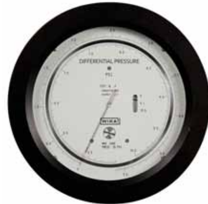
Gauge Pressure Indicator Series 1000 - 6" Dial

Stainless steel filters are mounted in the orifice of both units and are located in the bottom of the case.