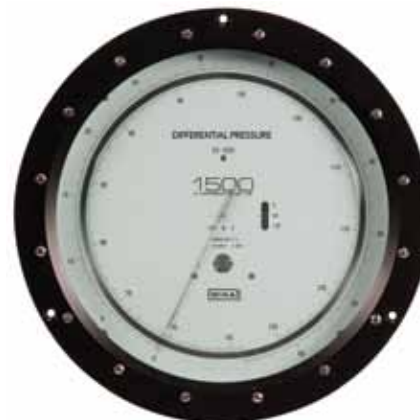
Differential Pressure Gauge Series 1500 - 8.5" Dial

Cast aluminum with tempered-glass window; flush mounted by three screws through the bezel