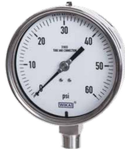
Bourdon Tube Pressure Gauge Model 232.50, 4½"

Ambient: -40°F to +140°F (-40°C to +60°C) - dry -4°F to +140°F (-20°C to +60°C) - glycerine-filled -40°F to +140°F (-40°C to +60°C) - silicone-filled Medium: +392°F (+200°C) maximum - dry +212°F (+100°C) maximum - liquid-filled