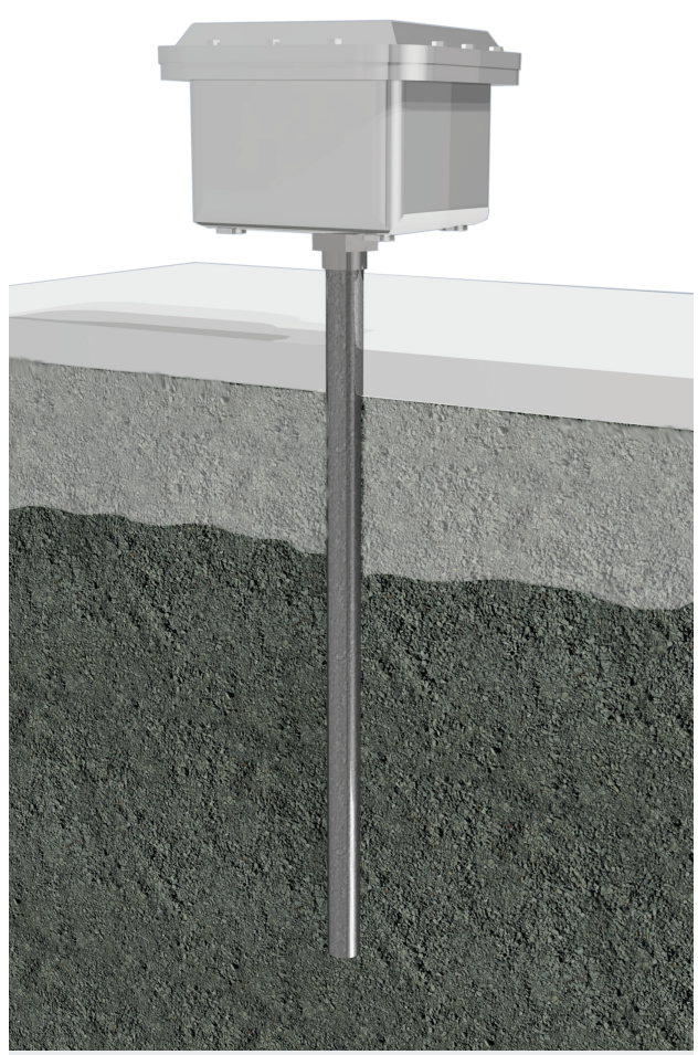
Model TC95-FP Frost Protection Multipoint

The WIKA designed frost protection multipoint is designed using an outer protection tube (pipe) for extreme cold environments. Inner guide tubes and heat transfer blocks allow for easy maintenance, calibration and replaceability of the sensors.