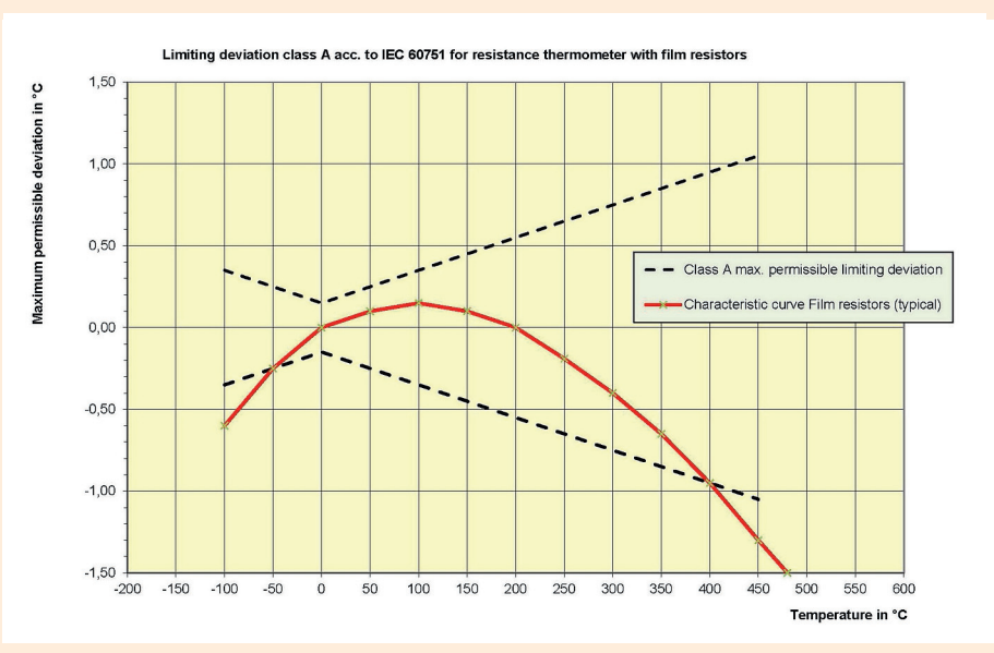
Figure 2: Characteristic curve of a standard film measuring resistor

This sensor type was not explicitly mentioned in the previous editions of IEC 60751: 2008 (DIN EN 60751: 2009). Users were therefore unsure whether the standard also applied to these new, cost-effective and exceptionally vibration-proof measuring resistors. In particular, the specification of the temperature ranges suggested that film measuring resistors could be used at the same temperature limits and with the same accuracies as wirewound resistors. In reality, however, film measuring resistors behave differently to their wire-wound counterparts due to stretching and shrinkage effects as well as to the diffusion of foreign atoms into the thin platinum layer. The result is a characteristic curve which leaves the standard range of permissible measuring deviations at low and high temperatures earlier than it is the case with wirewound measuring resistors (Figure 2). This behaviour physically arises as a result of the design and the materials used and must not be